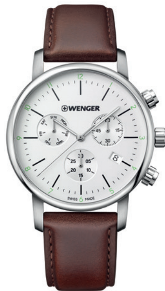
Urban Classic Chrono 01.1743.101