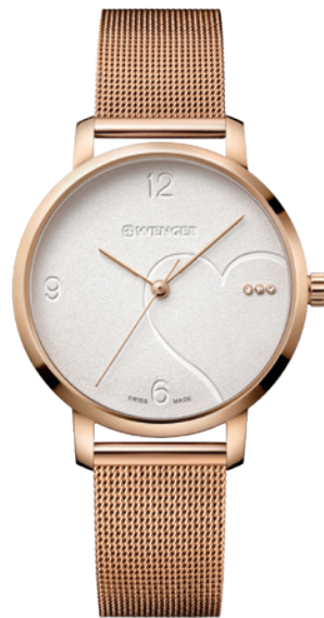
Metropolitan Donnissima 01.1731.112