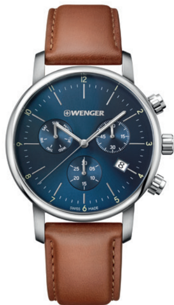
Urban Classic Chrono 01.1743.104