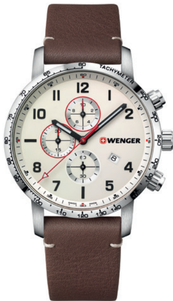
Attitude Chrono 01.1543.113