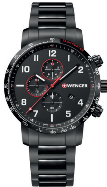
Attitude Chrono 01.1543.115