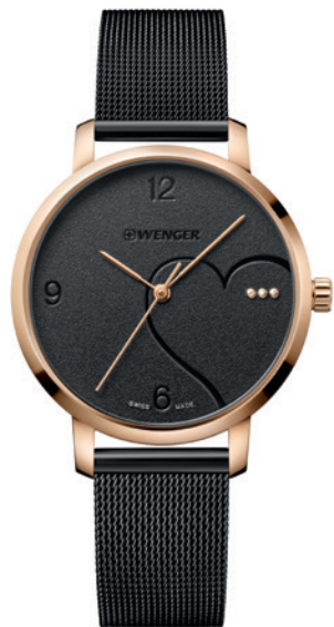
Metropolitan Donnissima 01.1731.113