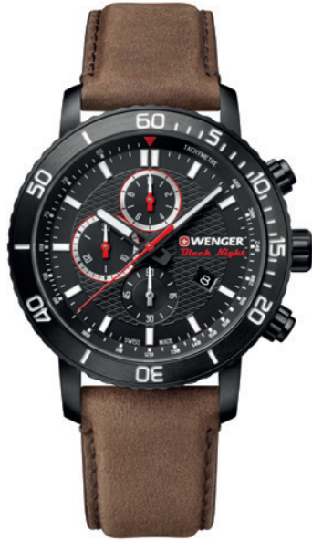
Roadster Black Night 01.1843.107