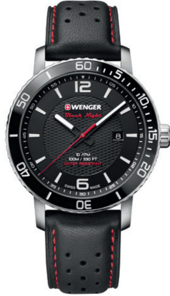
Roadster Black Night 01.1841.101